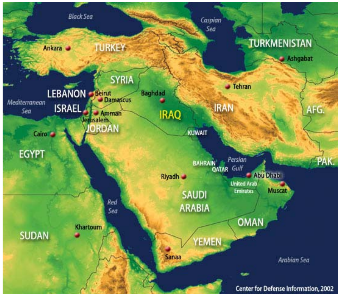
Figure 1. Middle East Regional Map (From Ref. http://www.cdi.org/terrorism/iraq_map.cfm (Accessed on 13 June 2004))

While the past sheds light on Iran's strategy for post-Saddam Iraq, this question can only be partially answered until Iran's security policy leaders and institutions are also examined. Chapter III will explore these leaders and institutions with the goal of gaining an appreciation for their alternately competing and complementary security policy agendas.